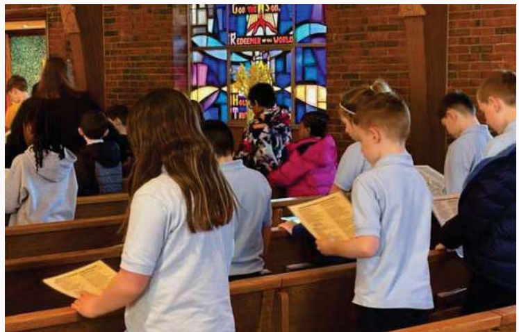
Students at School bless themselves as they pass the Chapel.

Saturday Rosary 1st. Sat. of the month at 3 p.m. in the Church - led by parishioners.