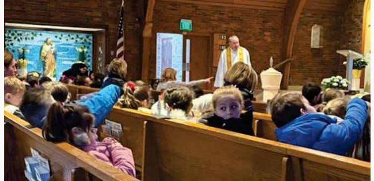
Students from Our Lady's Academy praying at First Friday Mass.

Conference and Adoration with students from Our Lady's Academy.